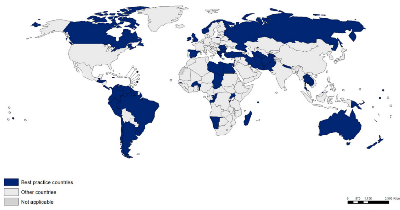
Figure 1. Adoption of comprehensive smoke-free policies 2018

Adoption and implementation of effective legislative, executive, administrative and/or other measures are necessary to protect people from exposure to tobacco smoke, as voluntary smoke-free policies are ineffective and do not provide adequate protection.