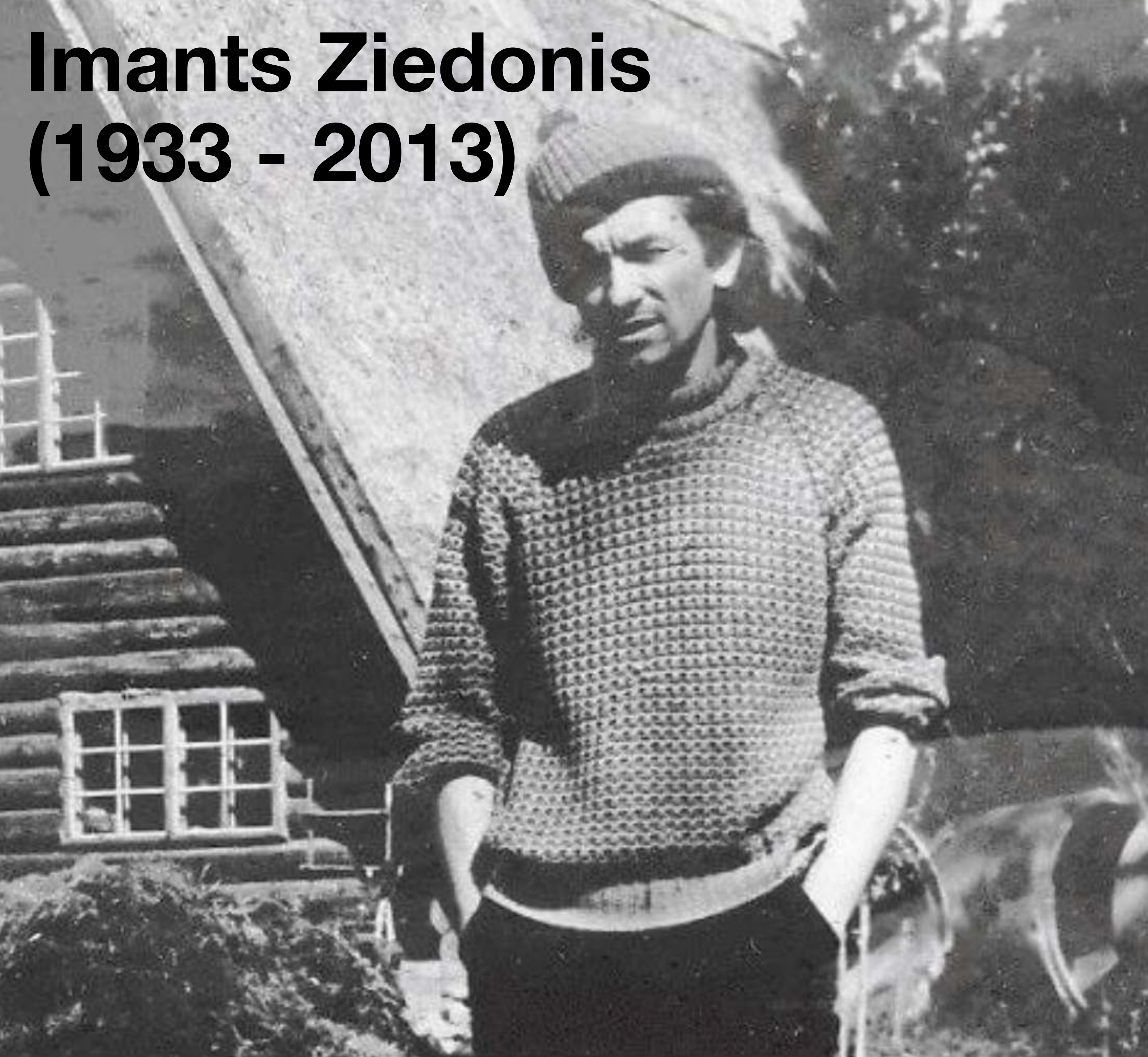
Imants Ziedonis (1933 - 2013)