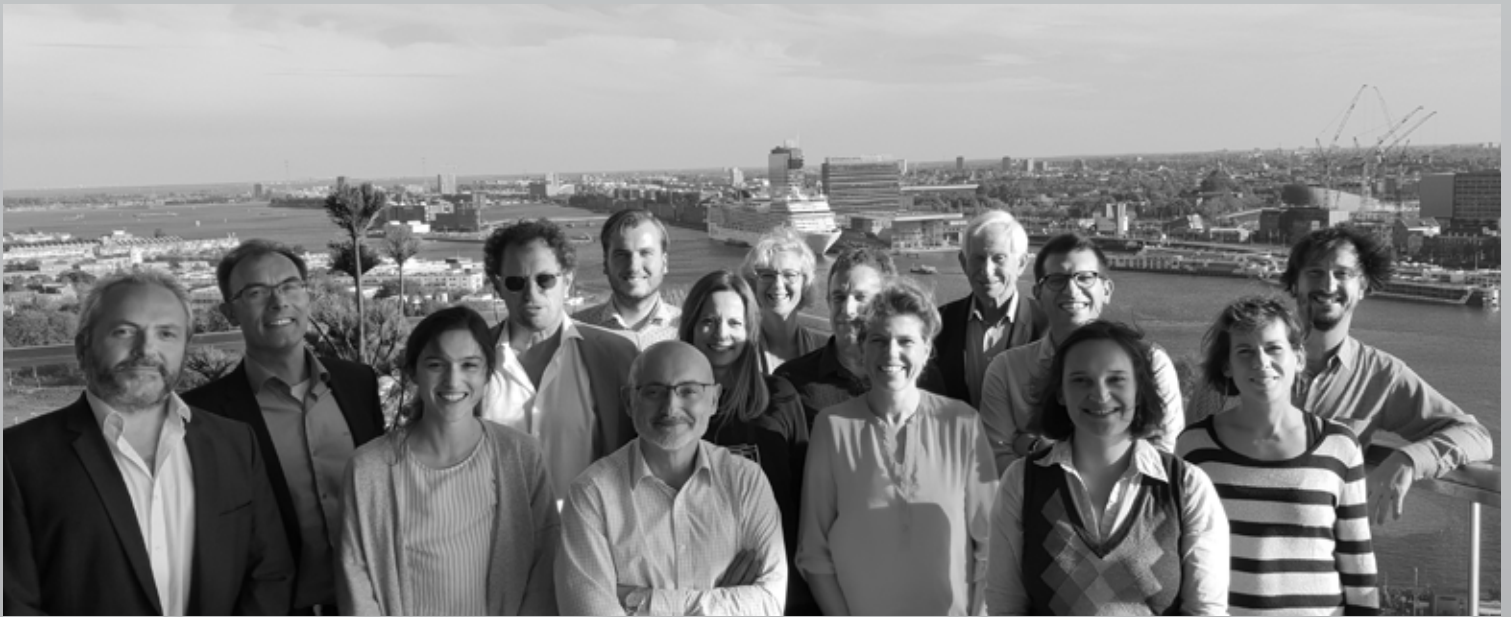
EATRIS ERIC Coordination and Support team